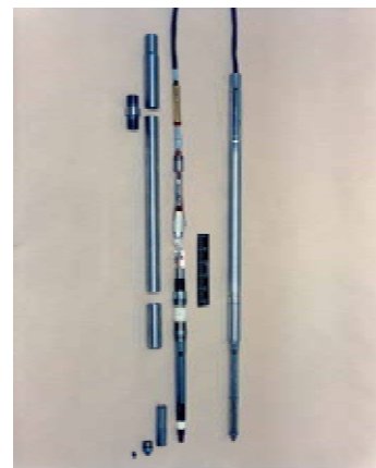
Laser Induced Fluorescence Sensor Thermal Desorption Petroleum (POL) Sensor VOC Hybrid Sensor/Sampler Electro-Chemical Explosives (TNT, HMX, RDX) Sensor