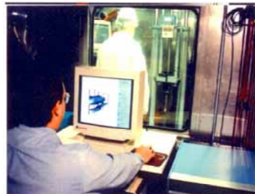
SCAPS Truck Conducting Characterization Acquisition of Subsurface Soil Layering and Contamination Processing