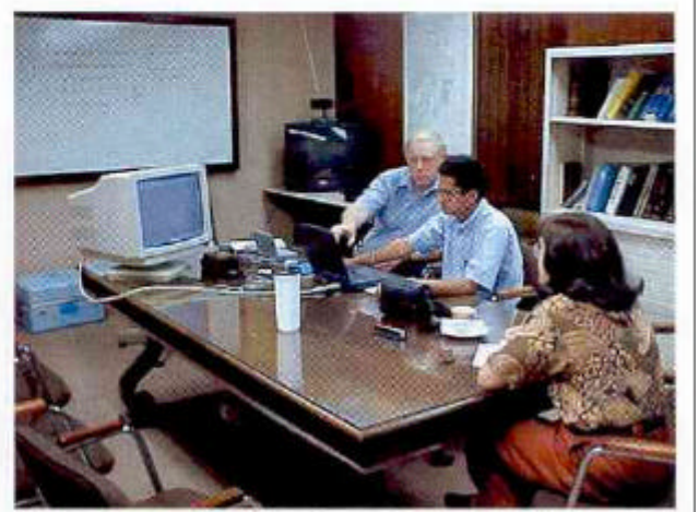
Engineers control PAL-R operation and follow driving from the office.