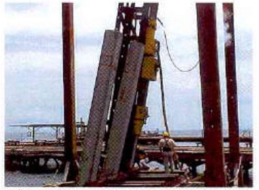
Driving pile: sensors are inside red square, connected by cable to PAL-R.