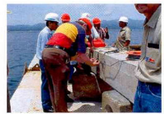
Attaching sensors to pile.