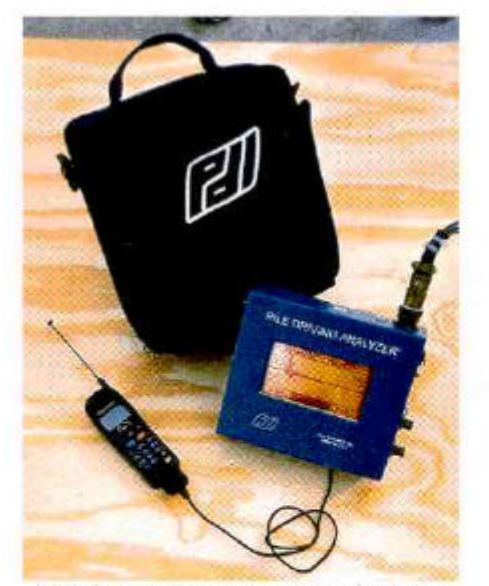
PAL-R, carrying case and cell phone