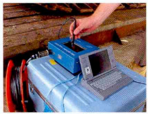
PAL-R receives signals from sensors. Field operation is minimal, and done by touching screen with special pen, Laptop is optional.