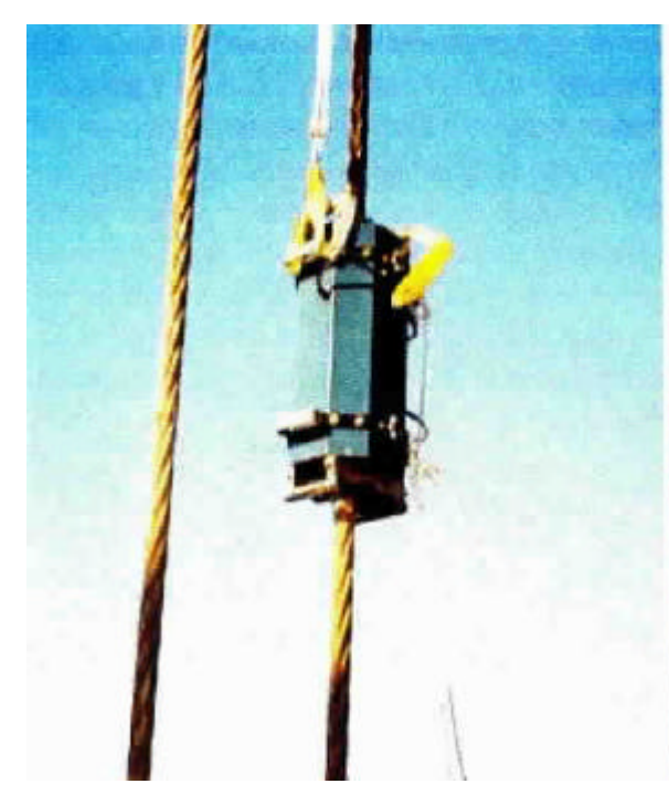
Figure 2. Test Instrument Installed on Suspender Rope