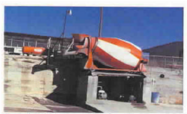
Central Holding Vessel for Sameday/Overnight Stabilized Concrete