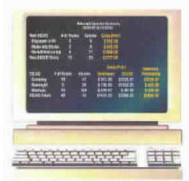
Typical profitability report