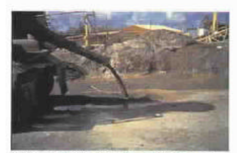
"Dumping" of Returned Concrete