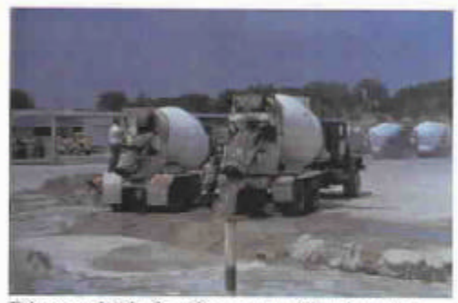
Disposal Pit for Concrete Washwater