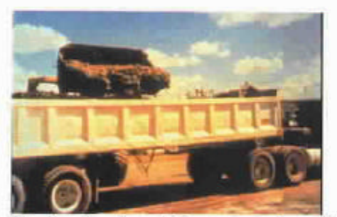
Hauling hardened Concrete to Landfill