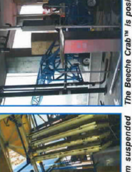
Crab™ hoist above, ready to lifting beam suspended rom the patented Beeche be lifted.