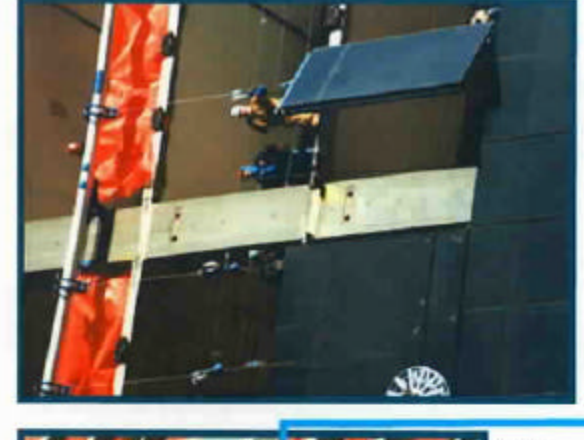
installation point on the building Traversing panels to the