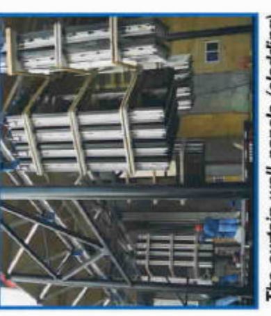
Grid below the patented Beeche are stored on a Material Handling Aluminum Space Frame System until they are hoisted into position The curtain wall panels (cladding) on the building.