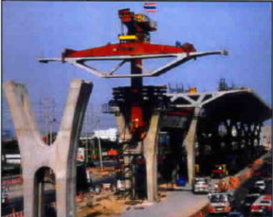
55 kilometers of elevated 6 lane expressway under construction in Bangkok.