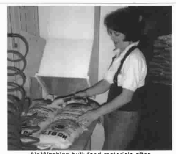
Air Washing bulk food materials after Exposure to bi-products of combustion