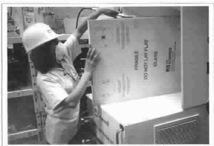
Air Washing products for retail sale in a building materials store following fire damage