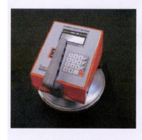
The PQI Model 301