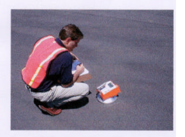
The PQI Model 301 in Use