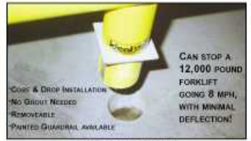
EASY CORE-IN INSTALLATION