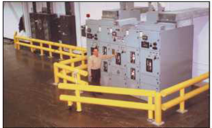
INDOOR MACHINE HEAVY GUARDRAIL WITH GATE- FORD MOTOR COMPANY