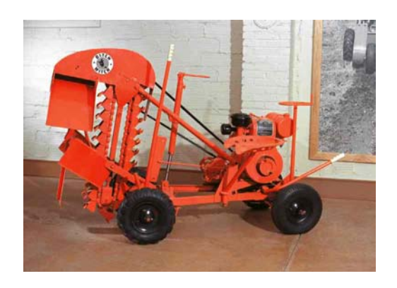
The ASME National Historic Mechanical Engineering Landmark