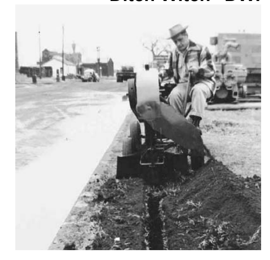
Ed Malzahn digs a 4-inch wide trench with the DWP trenche