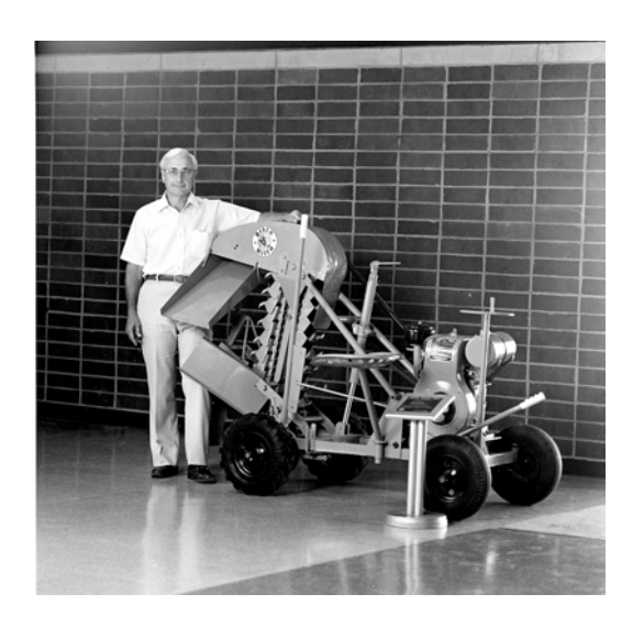
The first production model DWP trencher.