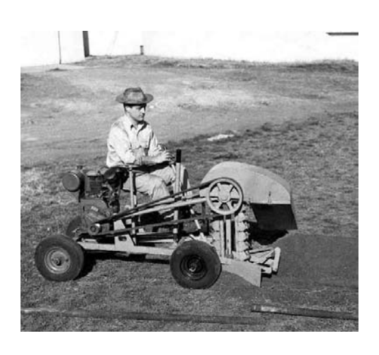
The DWP trencher is used to prepare for the installation of a water line.