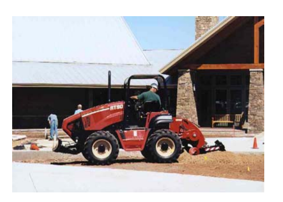
Today's Ditch Witch® Trencher.