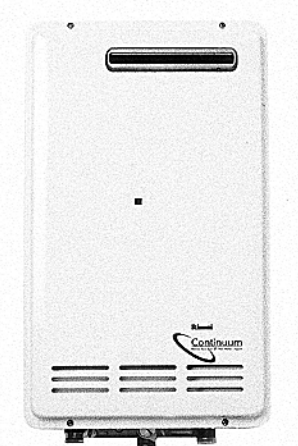
Internal Tankless Water Heater

*Actual size of unit: 23 5/8" H 13" x 25"/ 32" W 8 13/16" D