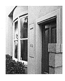
Recessed Unit, External Installation.