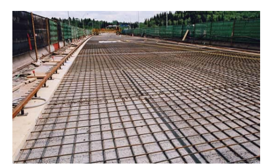
Steel in Topping Prior to Pour