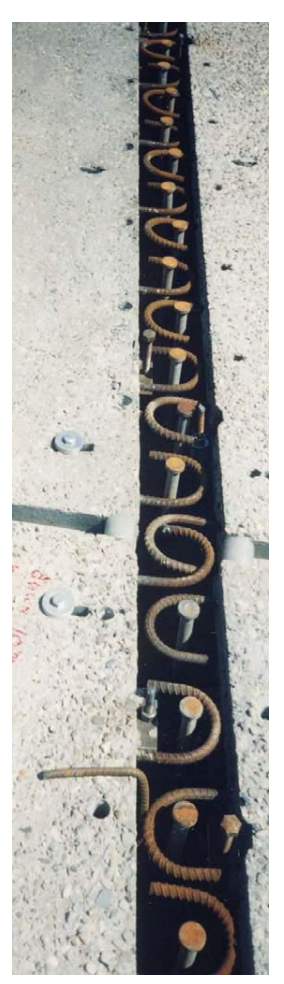
Tie Steel Projecting from Panels Over Supports, Anchored Around Studs