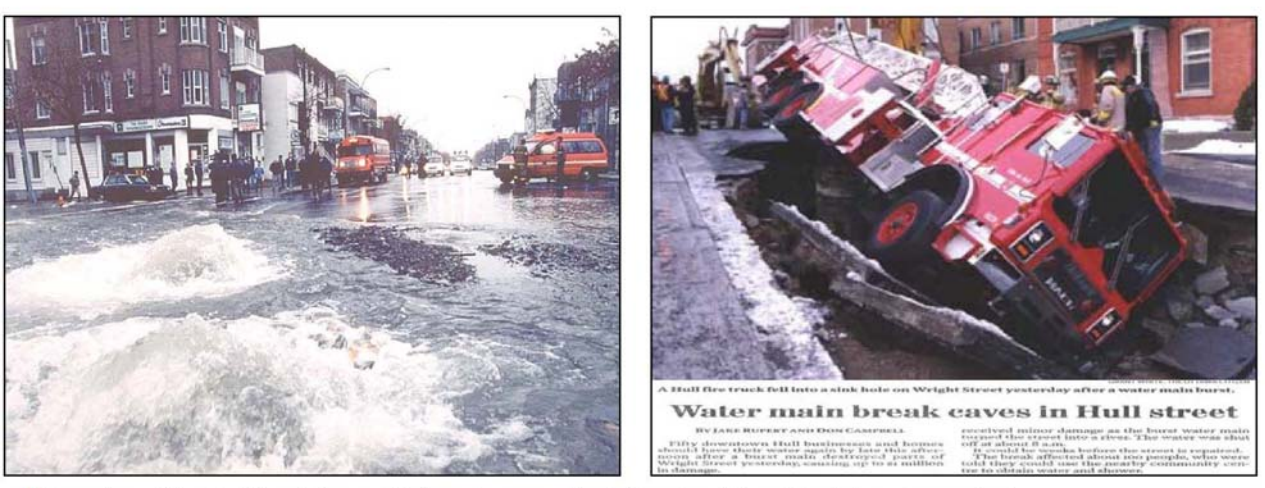
Examples of the significant damage that can be caused by leaks when left undetected and unrepaired