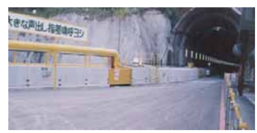
(a) PCP entering the tunnel

Figure 2. Inlet loading system of PCP transport of limestone in Kuzzu, Japan