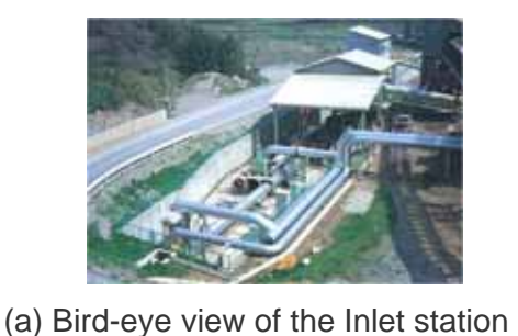
Figure 1. Two types of PCP used in Japan by Sumitomo Metal Industries (SMI)

(b) Materials loading into capsules at inlet