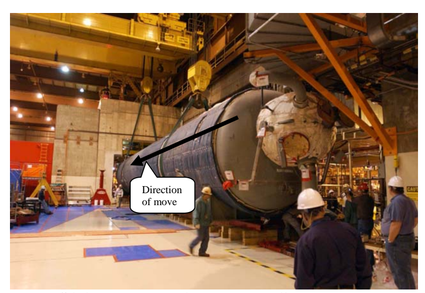
Sliding new vessel into place to 2" clearance