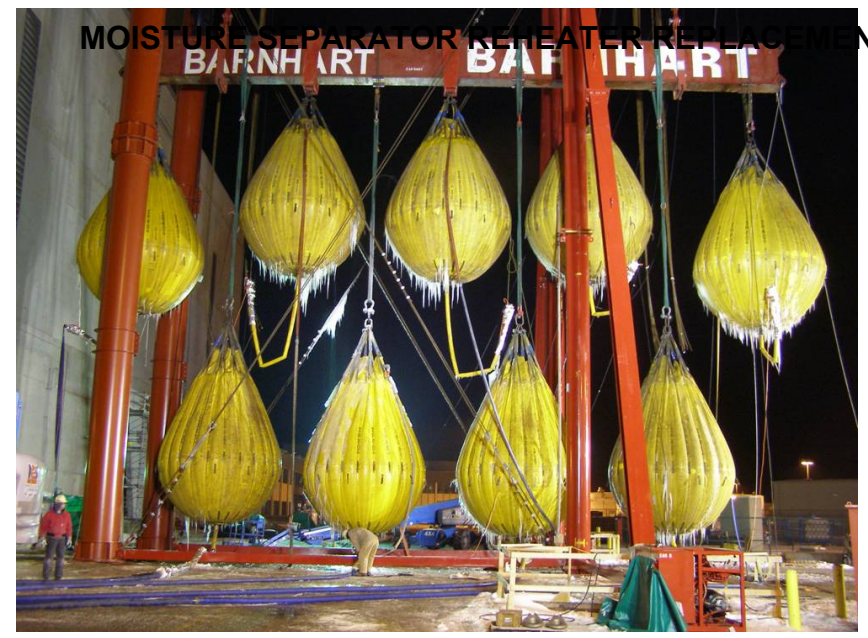
Testing modular lift tower with water weights