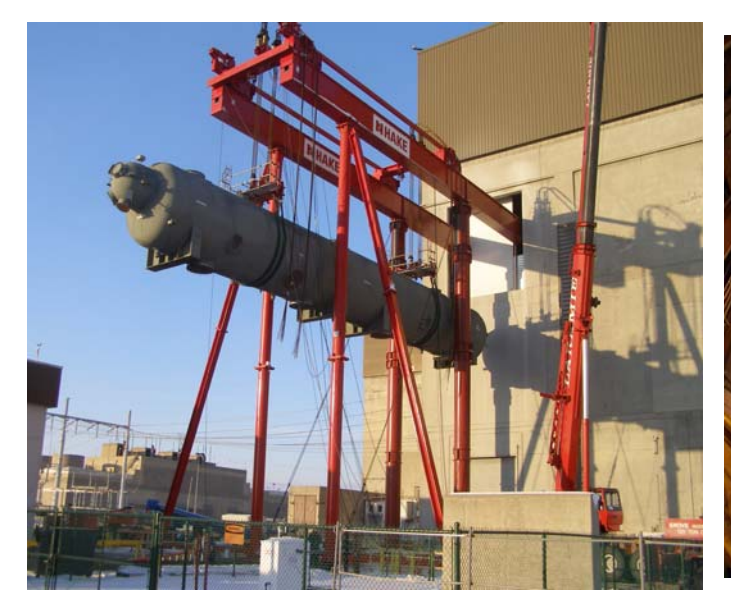
New vessel lift for move into power plant

New 113' long MSR spanning two rail cars