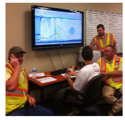
Telematics allows NorthGate to maximize the use of our equipment, as well as help better plan and schedule operations.