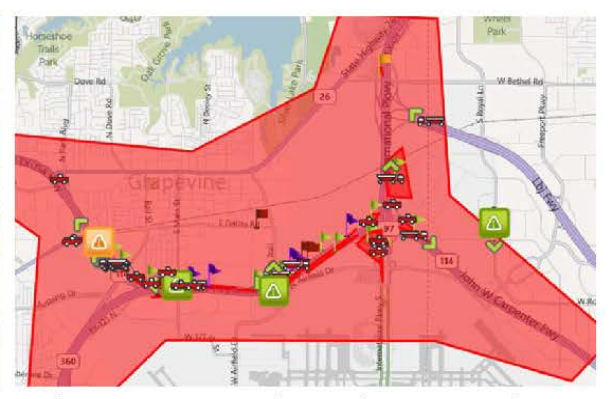
GPS Fleet Management provides real time data for managing our trucking operations.