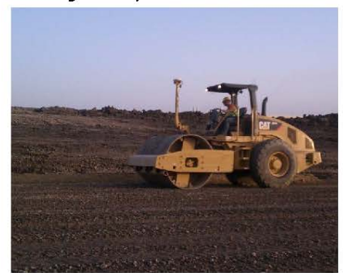
Shown is NorthGate equipment utilizing the intelligent compaction software, with the receiver at the top.