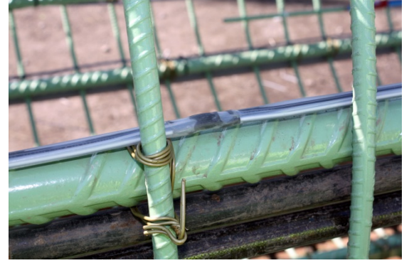
Digital thermal sensor on cable