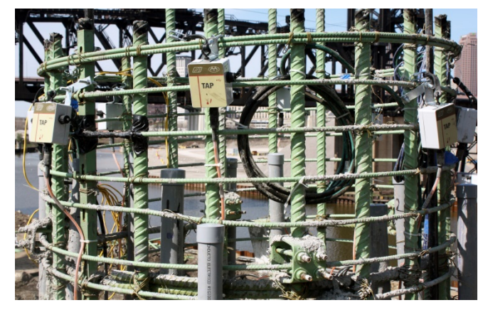
Shaft fitted with THERMAL WIRE cables and data acquisition ports (one per cable)